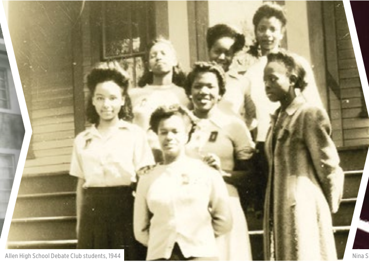
Allen High School Debate Club students, 1944