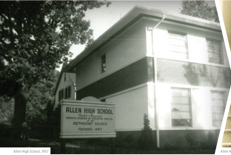
Allen High School, 1957