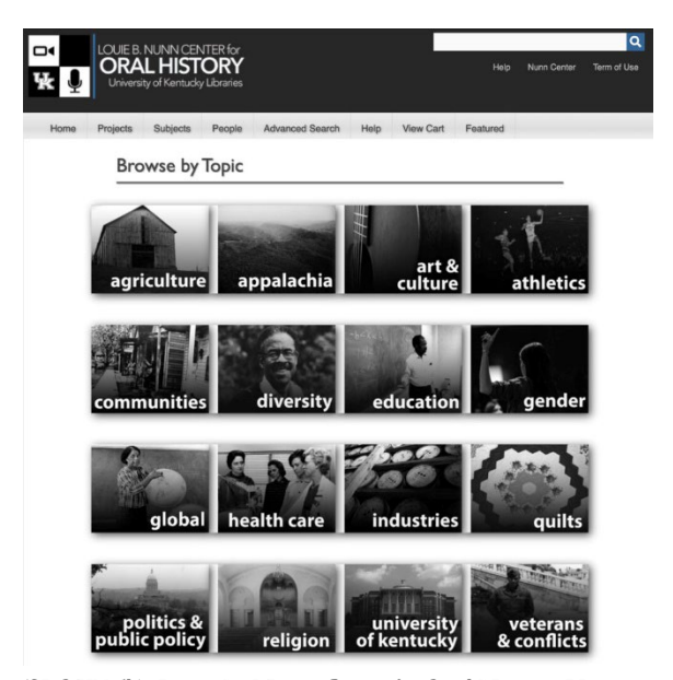
Nunn Center Catalog (SPOKEdb), Louie B. Nunn Center for Oral History, University of Kentucky Libraries

Interest in and exploration of Appalachia has not wavered after the turn of the twenty-second century. The projects have become broader in scope and content, such as Just Transition: Post-Coal Transition Movement In Appalachia, Affrilachian Symposium, Landscapes and Forests of Kentucky, the University of Kentucky Appalachian Center, Jenkins Coal Town Archaeology, Personal Responsibilities in a Desirable Environment, and the award-winning three-project series ACTION: Cancer In Kentucky. Developed by the University of Kentucky's Appalachian Career Training In Oncology (ACTION) Program<sup>vii</sup>, the oral history project(s) "prepares high school and undergraduate students from the University of Kentucky to pursue oncology careers and to engage the community in ways that will enhance cancer education," viii