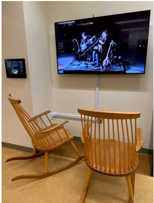
MerleFest Archives listening station, W.L. Eury Collection, Appalachian State University

In December 2020, Appalachian State University Libraries' Special Collections Research Center received the MerleFest Archives . The archives span the history of the festival, from 1988 to the present, and include recordings of performances, photographs, and ephemera. The collection was opened in time for the 35th anniversary of MerleFest in April. Below is a photo of the interactive viewing and listening station, which allows visitors the opportunity to relive historic festival performances.