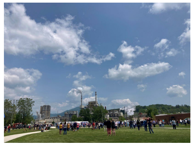
A crowd gathered to hear the last whistle from the Canton paper mill at noon on May 24, 2023. The whistle blew for five minutes.

On March 9, 2023, the current owner of the paper mill, Pactiv Evergreen, announced it would be closing the Canton plant and a facility in the neighboring town of Waynesville, leaving about 1,200 people unemployed. The mill's whistle blew for the last time on May 24 and the plant officially shut down on June 8, 2023.